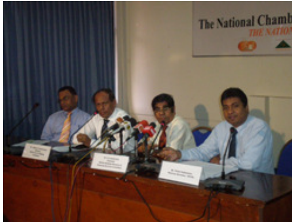
Press Budget Conference in progress

Hence it is important to have a mechanism at various levels in the administration to ensure effective implementation of plans and strategies to achieve the stated quantitative objectives. Effective and timely use of funds, both grants and loans, towards various infrastructure projects must be ensured. Managing public enterprises efficiently to make sure that they will not be a burden to the treasury is of utmost importance. It would have been desirable if the Government could give effect to some of the recommendations of the Presidential Taxation Commission through this budget, to demonstrate its commitment to implement such proposals.