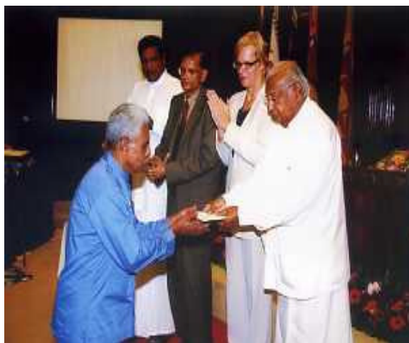
A recipient receiving Financial Assistance from the Hon. Prime Minister, Rathnasiri Wickramanayaka, with Madam Ambassador for Netherlands, Hon. Minister Prof. G.L Peiris, and Hon Minister Kumar Welgama, looking on.