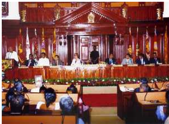
Hon Prime Minister, Rathnasiri Wickramanayake Chief Guest, addressing the audience at the Disbursement Ceremony –on 9 th July 2009, at the Presidential Secretariat.

The funds were through the BPF Programme funded by the Netherlands Govt.